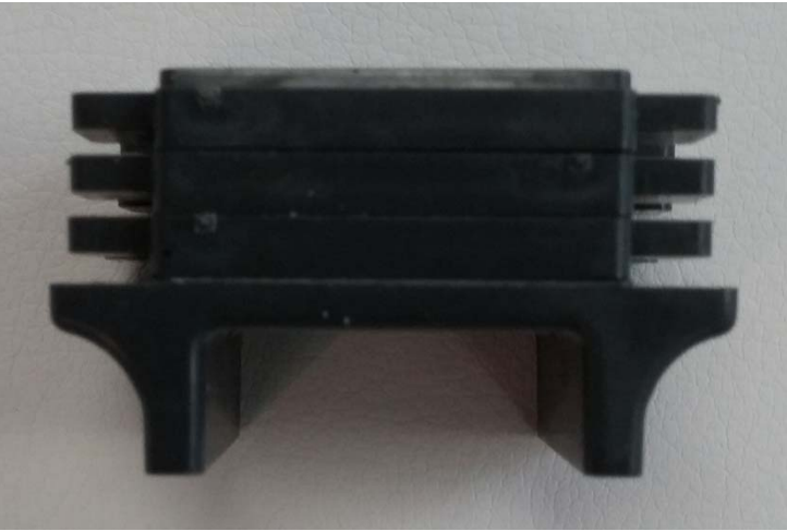
GLUED TOGETHER W/PVC GLUE