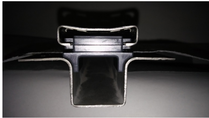
COSMO COVER W/SPACER