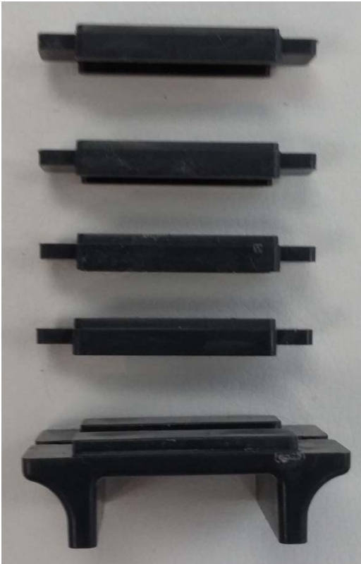
READY TO ASSEMBLE