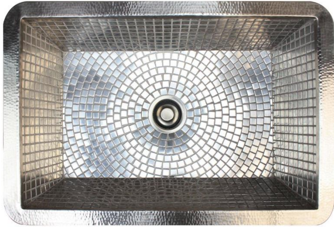
V031 SN with D007 SS Shown