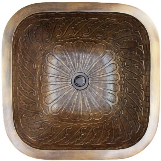
Shown in AB