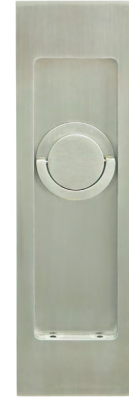
FH2792 Flush Pull w/ TT09 Thumbturn