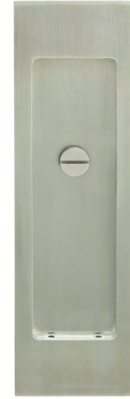
FH2704 Flush Pull w/ Thumbturn Release