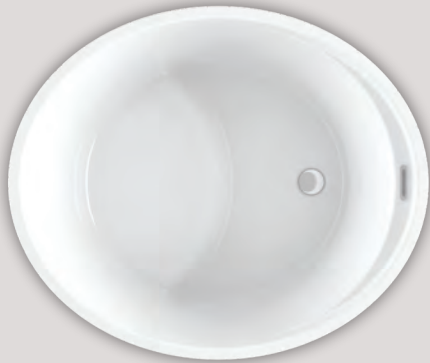
BEONE 4639 (FREESTANDING)